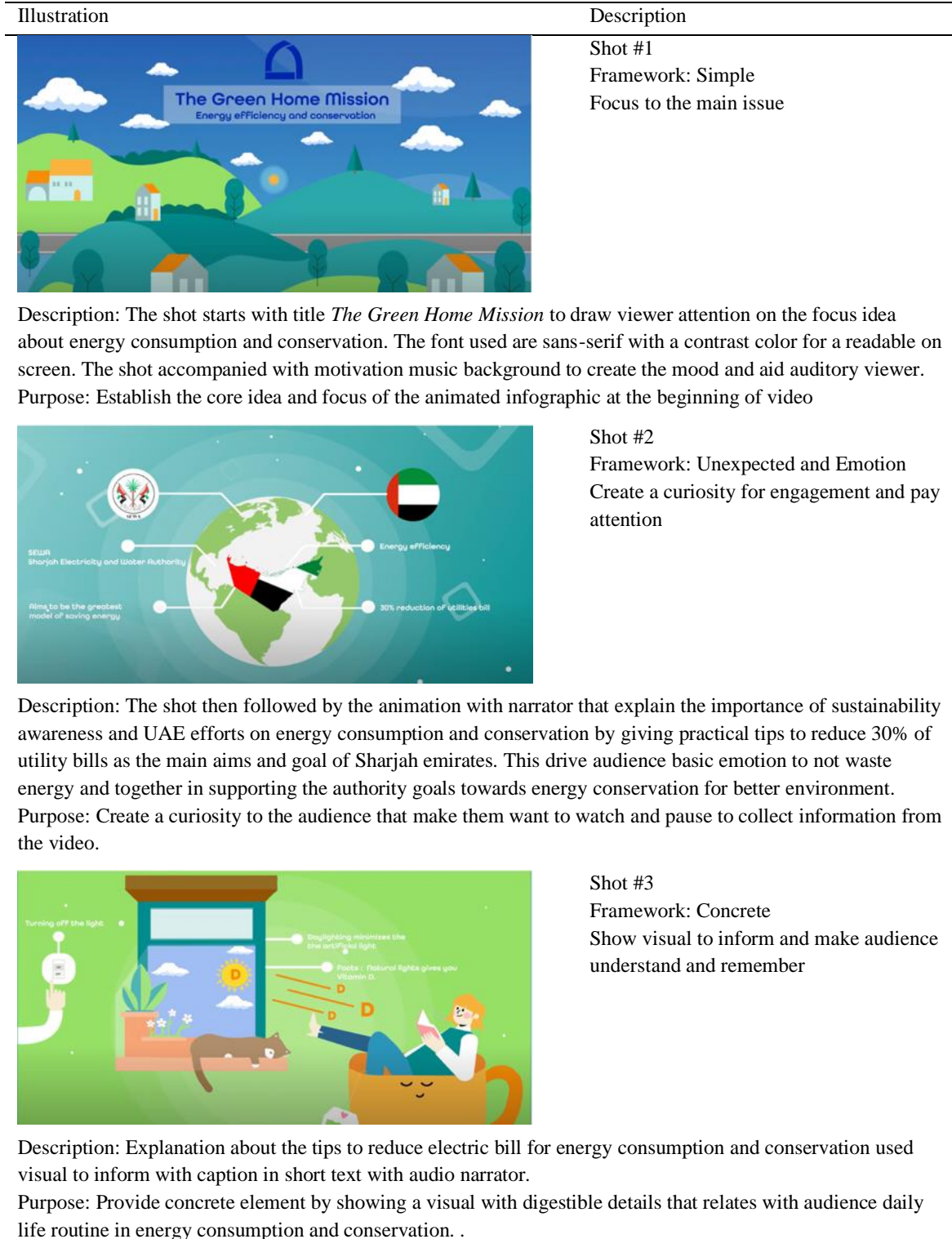
Table 4. Keyframe analysis of animated infographic video

Table 4 showed the keyframe analysis is a short part taken from the animated infographic of energy consumption and conservation video that illustrate how individual shots support and conform the used of SUCCES framework for making the idea easy to remember. A design guideline for the infographic were also embedded to inform the design solution (Lonsdale et al., 2021).