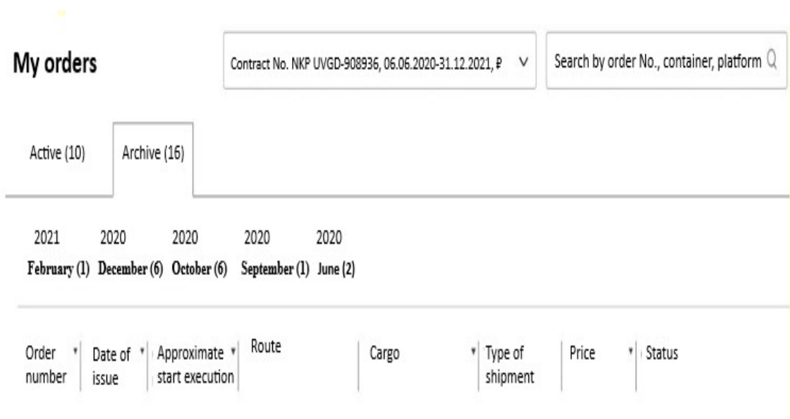
Figure 2. Number of incoming orders on the marketplace for 2020

In order to calculate how successfully RUSKON processes orders (provided there is one provider) let us enter the positive performance factor R (Formula 2). Figure 02 shows the archive of all orders received from KDV GROUP. Based on the data, it can be noted that there are 16 processed orders and 10 new orders. RUSKON processes all incoming orders (BTS indicator=100 %). The incoming order flow is fully processed. Therefore, the dynamics is positive.