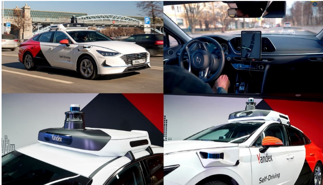
Figure 3. The fourth generation Yandex unmanned vehicle

Since unmanned taxi is an expensive pleasure, we will compare it with the taxi of the “Comfort” class - Hyundai Genesis G70. This car has similar characteristics with Hyundai Sonata. We will consider it based on the example of Yandex Taxi. The costs per car are presented in Table 01.