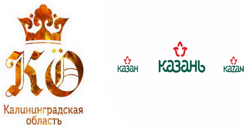
Figure 5. Branding of Kaliningrad

5) Kaliningrad Region. The Kaliningrad Region is one of the successful examples of Russian territorial brand. The project authors are the studio of Artemy Lebedev who had developed the symbols of Perm. The logo emphasizes the main wealth of the region – amber which is highlighted in the logo texture. Abbreviations underline the historical name of Königsberg.