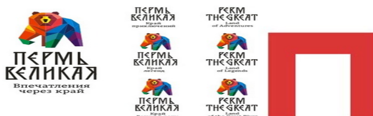
Figure 4. Branding of Perm

3) Perm. Promotion of the Perm image has become one of the most discussed among city residents. The project with three Ps "prosto poniatno povtoriaemo" which had been developed by the designer Artemy Lebedev, curator of the Perm Center for Design Development, received positive feedback from branding specialists. However, not all Perm residents approved the logo. The logo design of the Perm Territory (Figure 04) is based on the official emblem of the region.