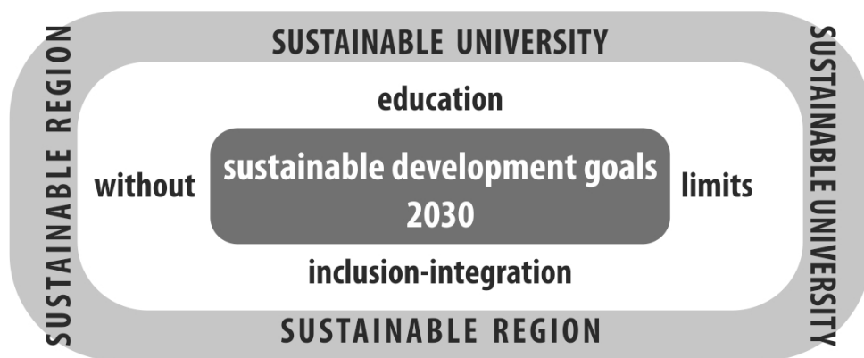
Figure 2. Education without exceptions: inclusion and integration in the system digital region - digital university

Bearing in mind the new views on European inclusive education, many pedagogical higher schools are implementing new trend teaching practices in the “digital university - digital region” system to develop the human and social capital of the territories. It would be fair to note the fact that some universities were involved in this even before the Covid pandemic. Still, most universities paid attention to the sustainability of the "region-university" system only in a situation of pandemic distortions that affected the economy and integration policy. European trends "Education without exception (Figure 2): practices of inclusion and integration", in fact, began to define new socio-technological communications among regions and universities in new formats of interaction. The “digital region - digital university” system preserves the main European indicators of democracy.