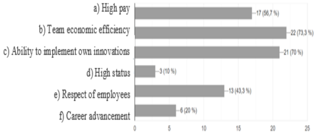
Figure 2. The Most Significant Values for a Manager's Professional Activity

In the system of values significant for professional activity (manager), the following trends were revealed (see Figure 2): the economic efficiency of the team (73.3%), the ability to realize personal innovations (70%) and high pay (56.7%) are approximately equally rated (more than 50%). Such values as a respect of employees (43.3%), career growth (20%) and social status (10%) fill the remaining lines of the "rating".