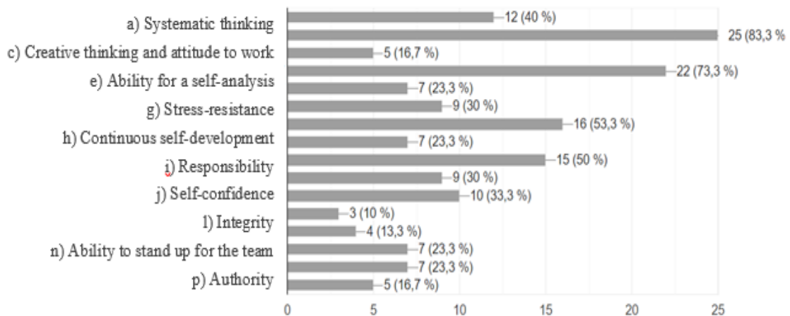
Figure 3. Successful Manager Qualities

An assessment of the successful manager qualities according to Figure 3 showed that a modern manager should at first be able to make sound economic decisions (83.3%), be result-oriented (73.3%), stress-resistant (53.3%), and responsible (50%). The respondents ranked systemic thinking (40%), organizational skills (33.3%), communication skills (30%), the ability to stand up for the team, the ability to self-analysis, optimism, and self-development (23.3% each) as fewer priority qualities. Such qualities as the authority (16.7%), creativity (16.7%), the ability to make a compromise (13.3%), and honesty (10%) complete the list.