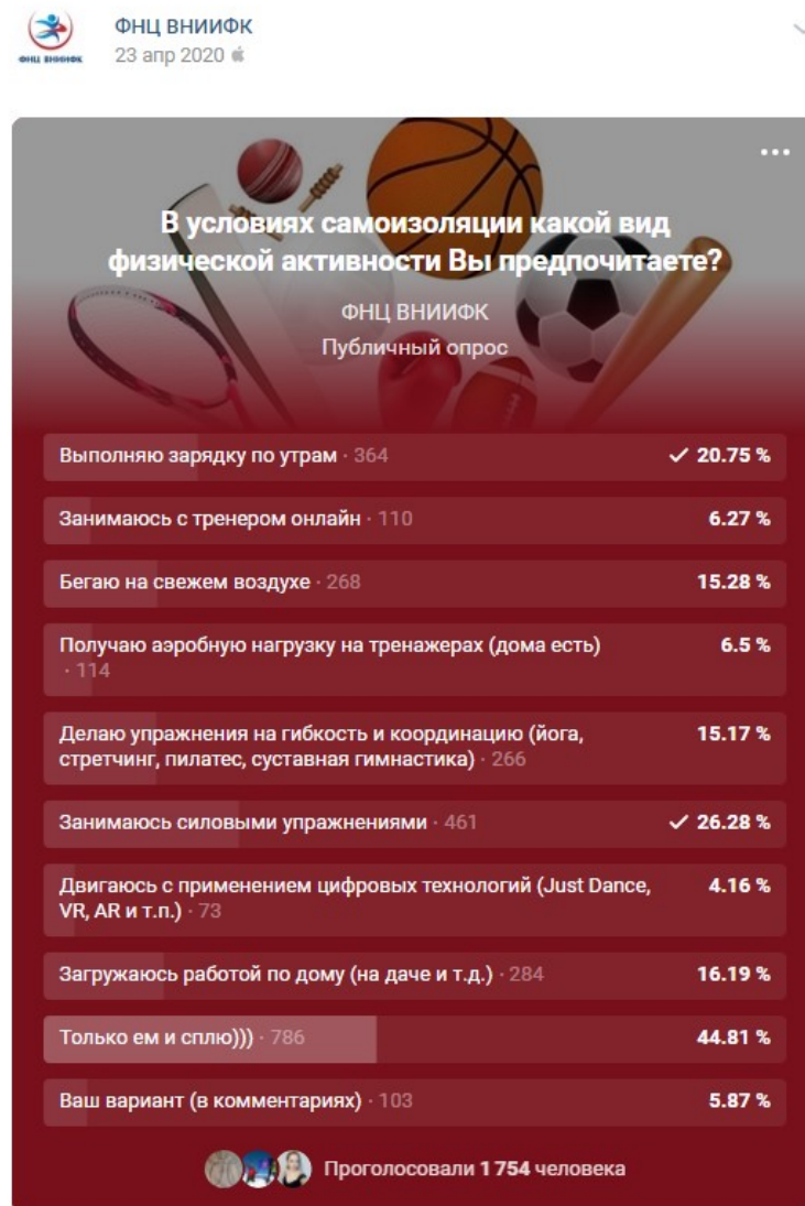
Figure 1. Page of the survey conducted in the vk.com social network

survey), the peculiarities of the organization of physical activity of the population were determined in the context of the restrictions imposed related to the COVID-19 pandemic. It was proposed to attribute the ways of organizing one's own motor activity to those selected from the nine proposed ones or to determine one's own, which was not included in the list. Each respondent could choose from one to three options most suitable for them. The geography of the study included respondents from Russia, Ukraine, Belarus and Kazakhstan.