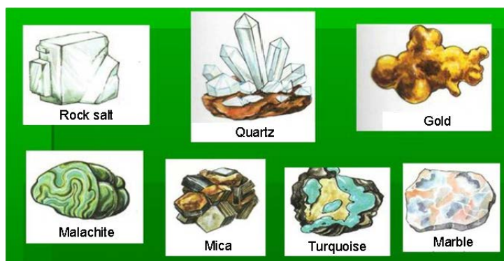
Figure 2. Types of minerals

The fourth problem is that the existing licensing system hinders development of mining production and the possible inflow of investments in this industry. The point is that the issue of transition to new organizational and legal forms is generally not on the agenda of subsoil users, there is an obvious flow of capital to the most promising mining enterprises and associations. Undoubtedly, this situation does not allow the state to promptly influence the development of this sector of the economy (King, 2012). Modern regulation of subsoil use must meet the requirements of modern market relations between the state and the subsoil user, and legal norms must be viable and effective (Markeev, 2015).