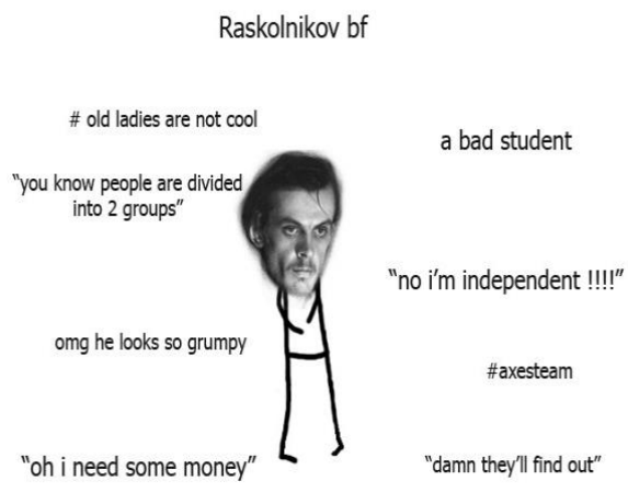
Figure 03. Raskolnikov’s meme as created during the workshop in June, 2018