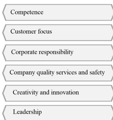
Figure 01. '5C + L' Model (2010-19)

JSC Russian Railways in its activities is focused not only on the implementation of external corporate social responsibility, but also on the internal one (Petukhov & Gorshkov, 2019; Samusev & Kalinova, 2018). The competency-based approach implemented in JSC Russian Railways allows promoting the corporate values of the company from the mission to the levels of posts, job competencies, sub-competencies and their indicators implemented in the personnel management system through this model (Kolbasova & Kutuzova, 2017; Malakhova, 2016). Competency indicators are used in the personnel selection, motivation, assessment, certification, training in JSC Russian Railways (Kutepova, 2018; Matsas et al., 2019; Staver & Yakimova, 2017). Considering the updated model of corporate competencies of JSC Russian Railways defined in the 'Regulation on the model of corporate competencies in JSC Russian Railways' approved by the decision of the Board of JSC Russian Railways dated May 13, 2019 No. 25, one might note an increase in the emphasis on internal corporate social responsibility (see Figure 01 and Figure 02).