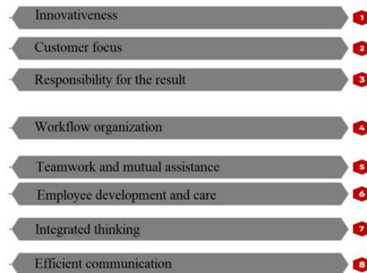
Figure 02. Updated competency model (since 2019)