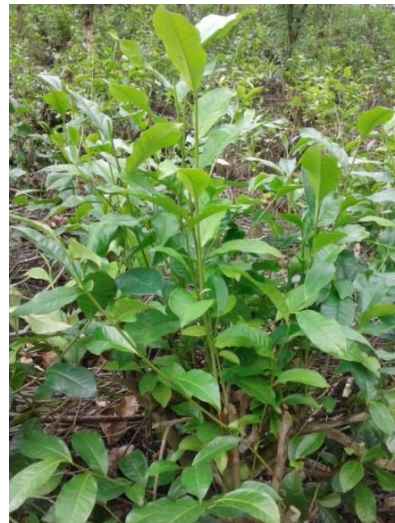
Figure 05. Clone 2025 type tea