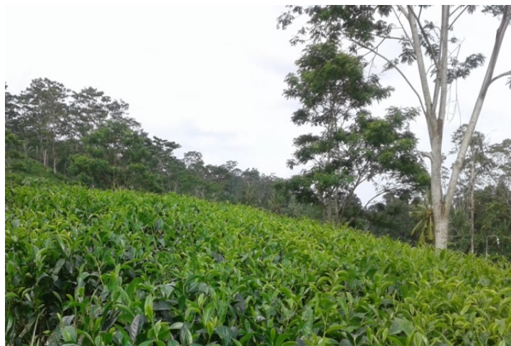
Figure 01. Albizzia chinensis tree

Out of the total number of 60 tea lands that were selected for the study, 20 lands cultivated high shade trees. This plant species is known as Albizzia chinensis as mentioned in the figure 01. The percentage of lands that planted high shade trees was 33%.