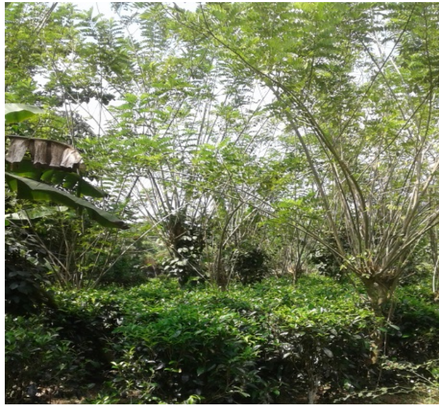
Figure 02. Gliricidia sepium tree

Frequently other income crops are cultivated, both to reduce the high temperature and to get additional income. Pepper and coconut could be seen as popular cultivated crops which is indicate the figure 03. 86.66% of the lands selected for the study cultivated additional crops.