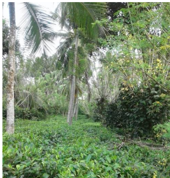
Figure 03. Coconut and Pepper crops

Frequently other income crops are cultivated, both to reduce the high temperature and to get additional income. Pepper and coconut could be seen as popular cultivated crops which is indicate the figure 03. 86.66% of the lands selected for the study cultivated additional crops.