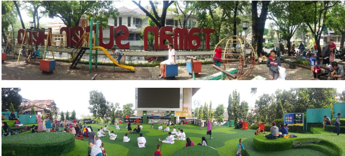
Figure 01. Superhero Park and Film Park, Bandung City, 2019