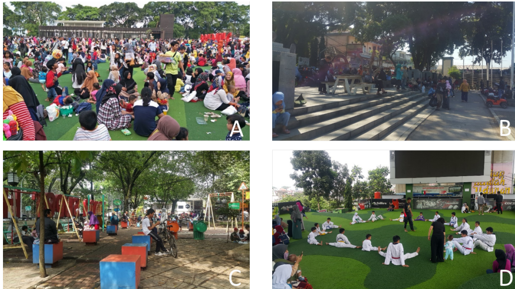
Figure 03. (A) Bandung Square, (B) Ujung Berung Square, (C) Superhero Park, (D) Film Park on weekend, 2019

Access to Activities in each park is determined based on scoring criteria, i.e. (1) range of activity and behavior; (2) community presence in the third space; (3) space flexibility according to user need; (4) the perceived ability of the place to do and engage in activities and events in the public space; (5) visitor's perception of the suitability of the design; and (6) economic activities. Overall, non-thematic parks have higher access to activities than thematic parks. Access to activities was captured based on observations in figure 03.