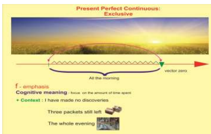
Figure 01. Present Perfect Continuous inclusive

The analysis can be presented in the form of a scheme (Figure 01), where the time continuum is represented as the axis on which the vector zero is marked, in our example ‘walking across the lawn’. The arrow indicates the precedence of the action – ‘has been looking through letters’ to the vector zero. The duration is highlighted – ‘all the morning’, emphasising the implementation of the seme ‘duration of the action’. The lexical units affecting the cognitive meaning, the cognitive meaning itself and the stylistic function of emphase are marked in the scheme.