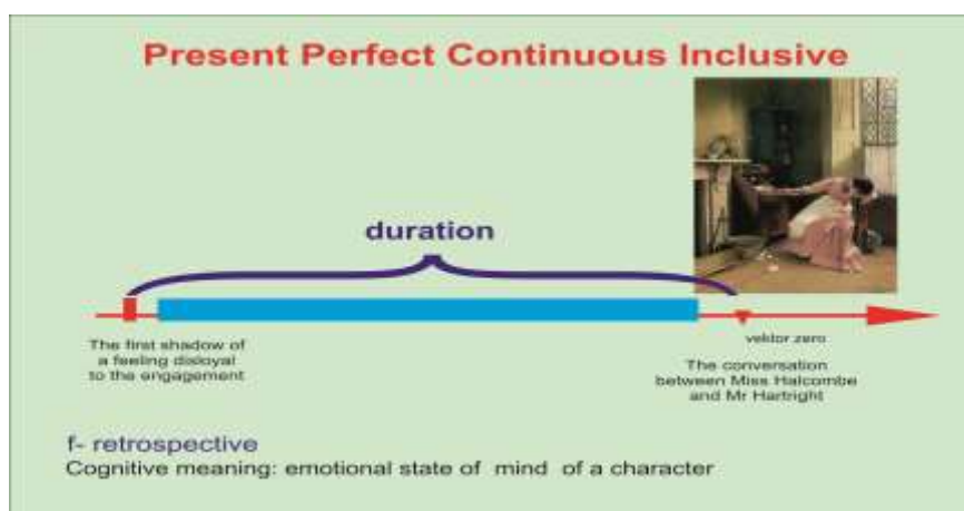
Figure 03. Present Perfect Continuous inclusive

the moment of the conversation between Walter and Marian. Laura's suffering began from the moment the shadow of disloyalty crept into her heart, therefore the localisation of the action in time is presented explicitly, lexically 'since the first shadow of a feeling disloyal to her marriage engagement entered her heart', the reference point is supported by speech conditions. This context also emphasises the process or duration of the action. A retrospective function emphasises a causal relationship. For the reason that Laura is suffering, Marian decides to speak to Mr. Hartright. The cognitive meaning is the emotional state of mind of the hero (Figure 03).