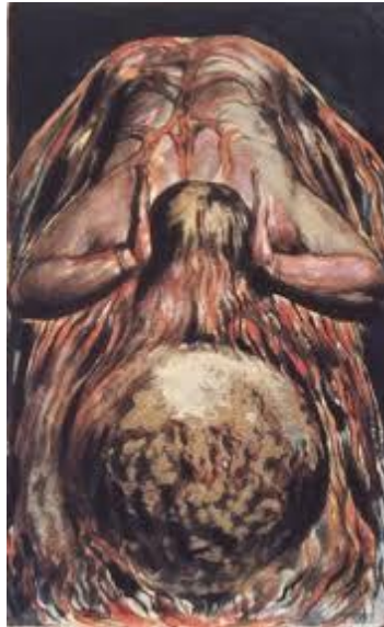
Figure 02. The Last Judgement (from Blake's paintings)

Predicts the ruin of the State. A horse misus'd upon the road Calls to Heaven for human blood. The lamb misus'd breeds public strife, And yet forgives the butcher's knife. Kill not the moth nor butterfly, For the Last Judgement draweth nigh (Blake, 2009, p. 14).