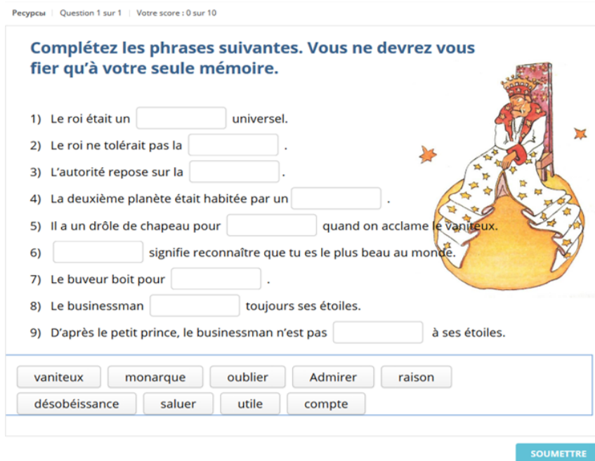
Figure 03. The vocabulary test

The fate of a literary art work is important, in that it is shaped by both the reader's or viewers' reception and the author's literary reputation (Vikulova, Gerasimova, Makarova, & Esina, 2016). In particular, the electronic resource offers an adaptation of the text in the French-language musical. The literary source was not originally adapted for the stage, but rewritten into the text of a dramatization, thereby beginning a life of its own, separated from the original text. Thus, the adaptation of a fairy tale for the music scene in a French-speaking musical is reflected in the electronic resource, in particular, presenting the history of the performance and offering excerpts of the musical version. The existence of a literary text in a different cultural environment makes it possible to talk about the parallel existence of two texts and their interaction - the author's text and the adapted text, the latter in accordance with the new format of its existence. The following task from the EER is addressed to a different visual interpretation of the text: "Is it possible to assert that in such art forms there is a search for and choices of those value dominants and moral supports that will help correlate the field of world cultural meanings and the perception of a modern child? Justify your point of view in the form of a presentation".