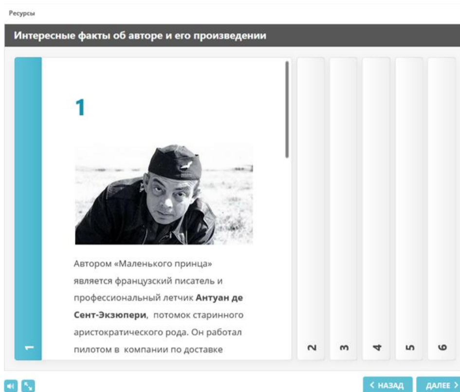
Figure 04. Interactivity "Interesting facts about the author and his work"

New information content is provided by interesting and little-known facts from the life of the writer, proposed in the format of interactivity (Fig.4). The assignment assumes again that one needs to (i) revisit the biography with which the students familiarized themselves before reading the book, and (ii) present a personal view as to the fate of the man as writer and pilot.