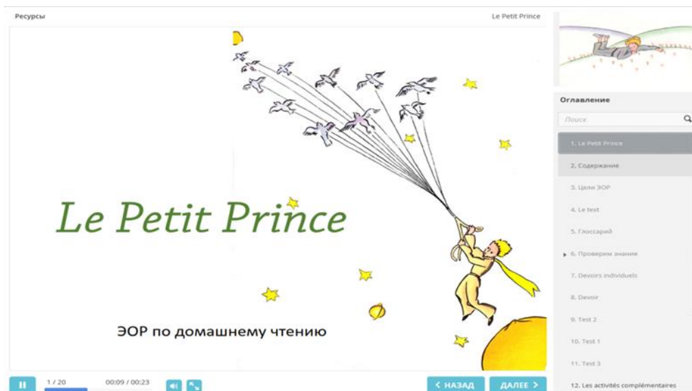
Figure 01. Structure of the electronic resource for home reading

The resource under review was developed to support French language classes based on The Little Prince , Antoine de Saint-Exupery's philosophical tale (Figure 1). It is precisely on the basis of an electronic resource that a competent professional approach to this story is possible, which stands out as a unique phenomenon in world culture and, with its moral and cultural message, represents an important value reference point in the intercultural educational environment (Tareva, 2011; Zheltukhina et al., 2016). This educational resource for home reading provides ample opportunities to present the authentic text with explanations, visual representations, audio and video support materials and a variety of interactive activities. The literary work underlying the resource sets a specific sequence to cover the material using information that contains cultural and country-specific content.