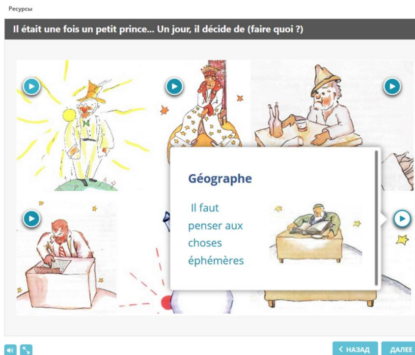
Figure 02. Interactivity on lexical test

The proposed tests and communicative tasks determine not only the reading strategy, but also the development of personal attitude to the texts.