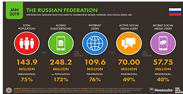
Figure 01. Information Technology Implementation Indicators (Brown, 2019)

According to the statistics, there are 109.6 million internet users in Russia. Study notes rising rates of internet penetration in Russia stands at 76% of the population. At the same time, 85% of all online users in Russia use Internet every day, and 11% at least once a week (Kuzmina, 2018). There is an obvious development of digital technologies indicators in Russia (Figure 1).