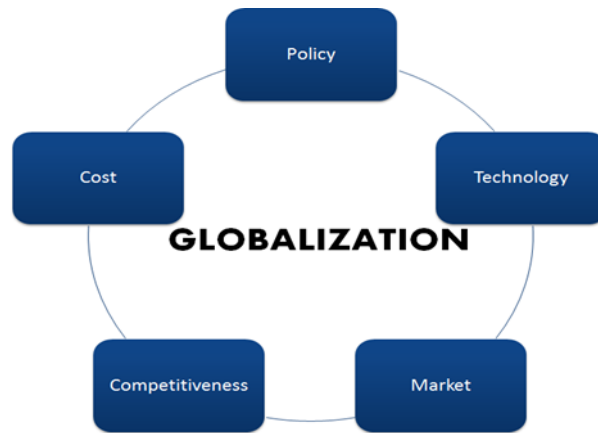
Figure 02. Factors of digital globalizatio

using Internet and network computing, which also leads to an increase in the number of companies making transactions with electronic commercial systems.