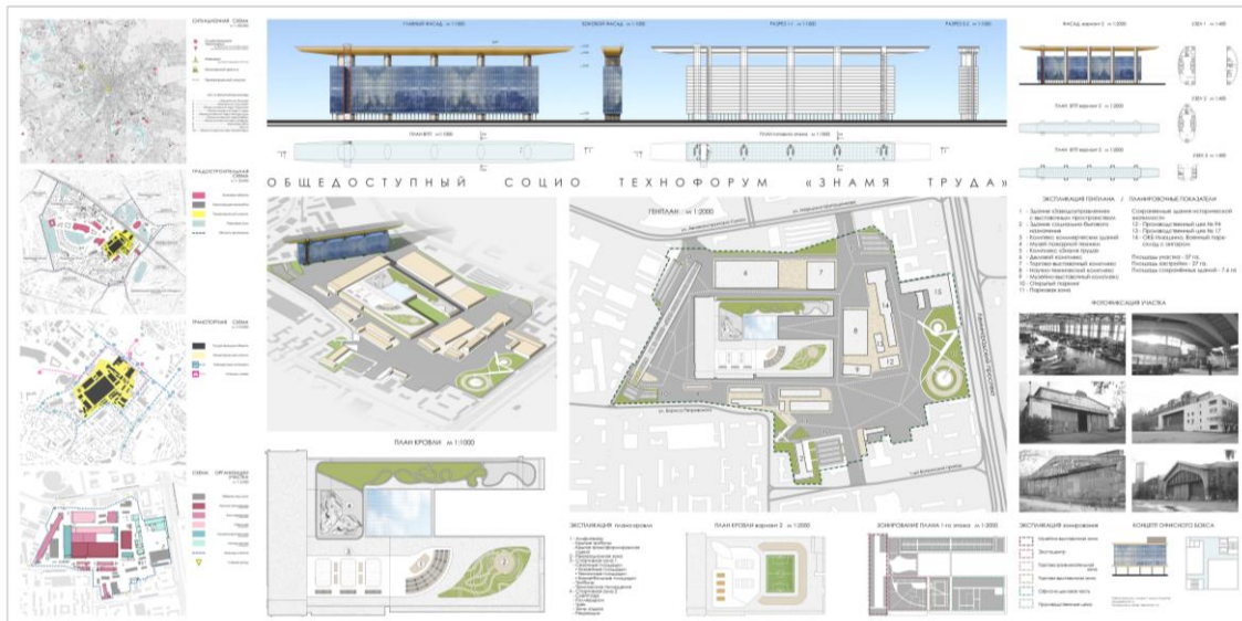
Figure 03. Design of public socio-technoforum Znamia Truda (developed by Vadim Bondarenko, 1st year Master's degree student, MARKHI (Cherkasov & Popova, 2019)

Since there are high-risers (the range of height is 25 to 50 m) around the perimeter of the former aircraft plant, while the average height of the factory buildings is 20 m or lower, a number of projects provide creation of altitude accents to highlight the complex in its environment: bridge-like building in Popova's (Popova & Tribelskaya, 2017) project that connects the territory of the plant to Dynamo metro station pavilions on the opposite side of Leningradskii Avenue; dominating plate with a sculpture in Seregina's project; a building with a landing strip in Bondarenko's project.