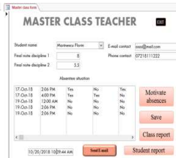
Figure 06. Master class teacher user interface