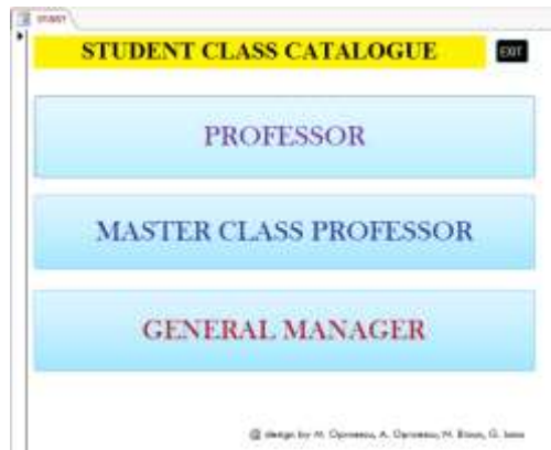
Figure 03. User interface

Working with a database, the first step is to define its fields. These fields are either entry specific to each professor teaching at a class of students: discipline name, awarded marks, final average, absent or specific entry data of the master class teacher: student identification data, absent motivation.