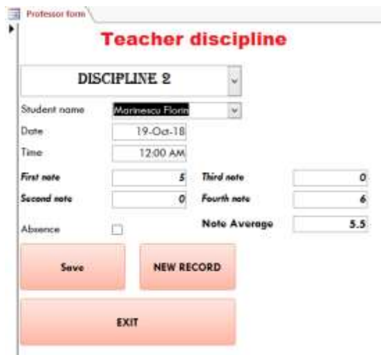
Figure 05. Teacher user interface

As can be seen in Figure 03, the home page application offers the possibility of differentiated access for a professor, master class professor or general manager. At this time, the application does not secure access via passwords, which is not a goal. The first step in using the application is to enter students into the database. This is done by the master class professor through the interface shown in Figure 04. These interface allows both the introduction of new students and the updating of the data which is modified. Careful attention should be paid to contact details, telephone and e-mail address, since contact with student tutors is based on these data.