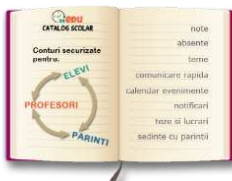
Figure 02. 24edu software solution

themes), organization (notice, calendar) information (SMS, email) and can be configured according to the needs of the school ( https://www.24edu.ro/ ). (Figure 02).