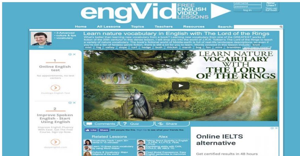
Figure 01. Using podcasts as social media in a PLE

Presentations Slideshare, Prezi, Scribd web service used as data stores, especially presentations that allow the users of the personal learning environment to place PowerPoint presentations in Flash format. These services provide the user with the opportunity to show their presentations online.