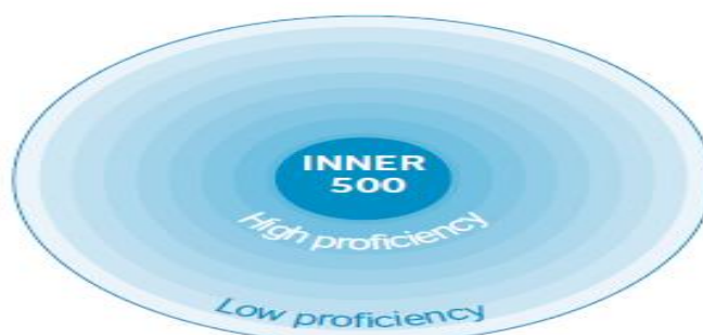
Figure 02. A new representation of communities of English (Graddol, 2006 p.110)

expanding circle countries do not agree with the definition. Some teachers perceive themselves and others perceive them to be NESs (Braine, 2010).