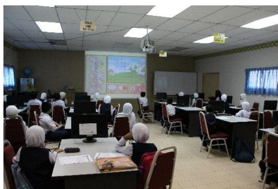
Figure 01. Introduction and tutorial session