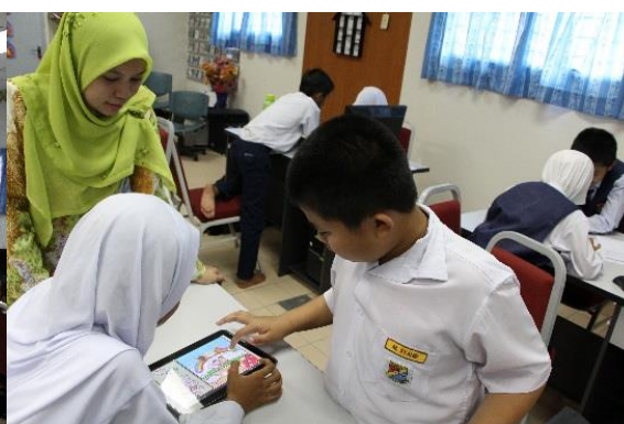
Figure 02. Digital game design activity in group

Essentially, this study involved both descriptive and interpretative analysis. With both methodological approaches, the researchers were able to obtain a holistic picture of the characteristics of a particular situation, the behaviours of the research participants, and pertinent information during testing. Using the Atlas. Ti. software, the qualitative data were analysed based on the triangulation approach and the typology approach using a thematic analysis. The holistic analysis of the field data helped yield the research findings that were precise and reliable.