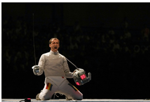
Figure 07. Mihai Covaliu

2000 – The Olympic Games in Sydney. Mihai Covaliu wins the sabre competition – Figure 07 (Costache, 2016). There were only two athletes in women’s foil final eight (Laura Badea and Reka Szabo) and they only managed to earn 4 th and 8 th places. Men’s sabre team ranked 4 th . In fact, women’s sabre and foil were the only weapons where Romania had representatives.