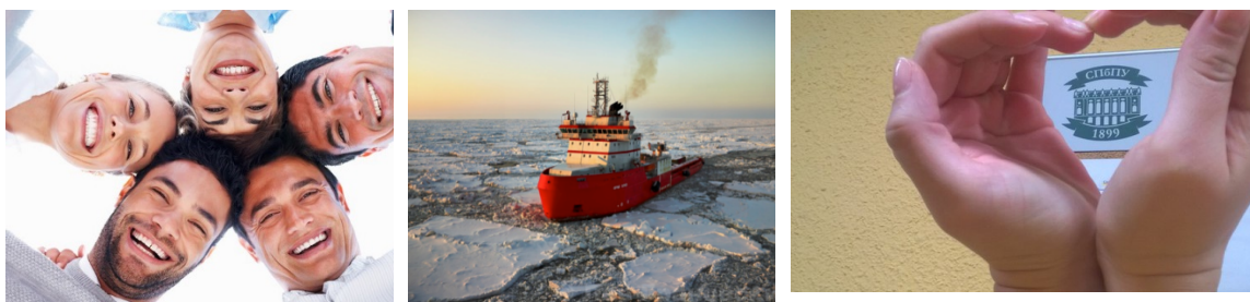
Figure 04. Examples of the selected images for the ZMET

According to the original technique (Zaltman, 2016, p. 99), respondents at Peter the Great Saint-Petersburg Polytechnic University were asked to find and choose the picture that indicated what the university brand meant personally to them. Next, respondents were asked to give their picture a title, comment on it and describe the emotion associated with the picture (Fig. 04).