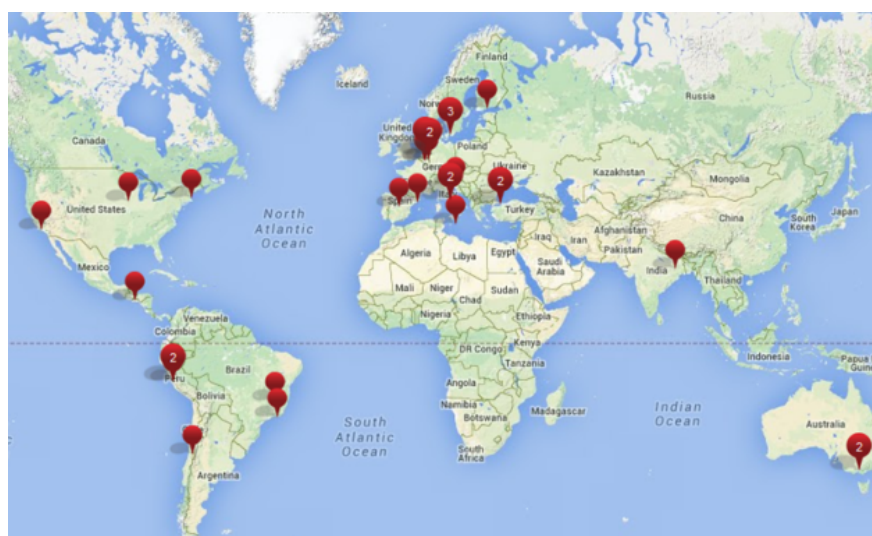
Figure 02. Map of academic locations that offer neuromarketing education (Bercea Olteanu, 2015, p. 191)

Confronted by change and technological advancement, curricula and additional educational services (classes, library and information services, recreational programs, etc.) as the central part of an educational marketing mix require constant updating in the light of modern practices. Neuromarketing activities are mostly developed in the research firms and not so much in academia (see figure 02), and still some authors doubt seriously if the subject content at a nascent state can be incorporated into curriculums, however other part of scholars advocate the uses of neuromarketing (as cited in Morin, 2011) and warn that ignoring such a considerable development would mean that learners would be outcasts of current marketing practices and methodological concepts of neuromarketing (Agarwal & Dutta, 2015, p. 457).