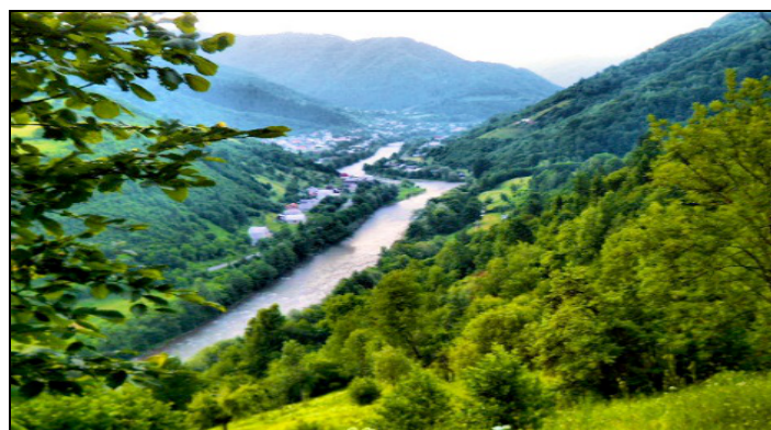
Fig. 1. Viseului Valley

Vegetation on the territory of Bistra is rich and very diverse, represented on altitude floors depending of several key factors, such as climate, soil, slopes, lithological substrate. For ecotourism, different plant species are natural attractions, interesting in that their ecosystems is untouched. Bistra hydrography is represented by two major rivers of Maramures Country, Viseu River and Tisa River each with its tributaries (see Viseu River in figure 1).