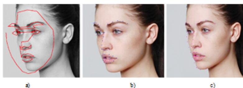
Fig. 1. a) Marking performed with ASM-modification that trained mainly on the frontal faces; b), c) markings made with optimally trained ASM-modifications

In general it can be assumed that the accuracy and reliability of points' alignment methods depends largely on the method of constructing the training sampling. Fig. 1 shows the comparison of marking equilibrium face points with large angle of rotation relative to the camera lens for several different ASM versions.