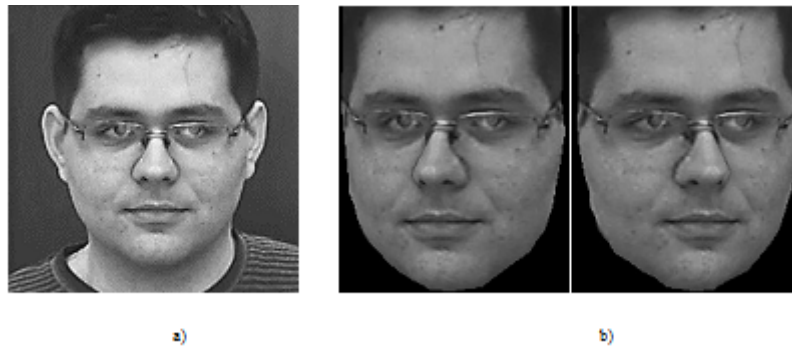
Fig. 4. a) The initial frontal facial image; b) the face images obtained by rotating along the horizontal axis by 20 degrees left and right

The set of face images rotated by the angle from -20 to +20 degrees relative to the optical axis of the camera was obtained from one front image using this algorithm (Fig. 4).