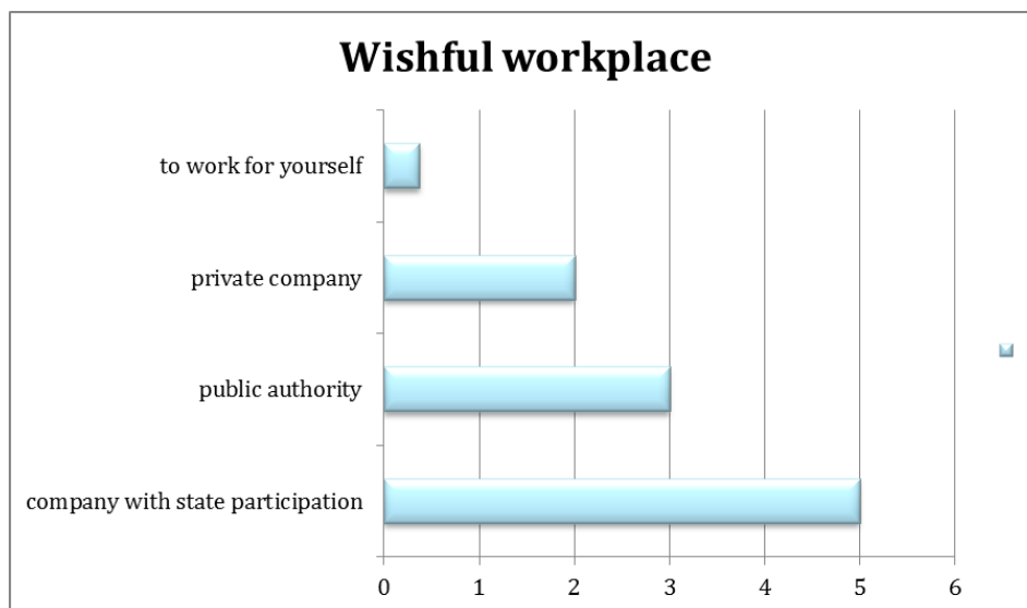
Fig. 2. Wishful workplace.

The youth perceive corruption as one of the serious obstacles on the way to their own business. It has infected the society and dented the citizens' confidence in the state to such an extent that only 18.74 % believe it may be overcome. When symbols of financial well-being and entrepreneurial spirit are aggrandised in the society as the ones claimed to be common for the entire population, and the applicable rules and regulations are restricted, or access to legal ways to achieve these values is fully blocked for the major part of the population, corruption cannot be rooted out (it is an opinion of 29.83 %). 40.19 % suppose that this threat can be dealt with only partially whereas 26.82 % take part in corrupt practices and deem it acceptable to give a bribe as they cannot achieve the necessary result in a legal manner.