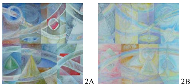
Fig. 2. (A-B) Ambiental square (Fronts 2A – Shadows; Backs 2B - Lights)

bidimensionally and tridimensionally; this extends the diversity of artistic expression. The idea is inspired from the diversity of the visual form, natural and created by human beings, spontaneous and deliberate.