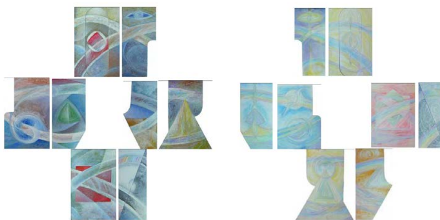
4 A – Shadows

The Universe is reflected in us – in our physical and psychic structure, in our intrinsic order and disorder - and its creation, in the rhythms, symmetries, asymmetries and everything that pulsates, appears and transforms within each human being. Resonance logic is present everywhere in the visual forms of reality and in those which make up the artistic aspects in time and space.