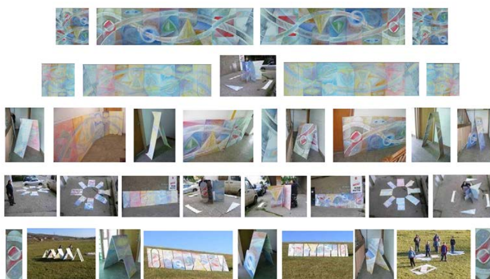
Fig. 3. Ambiental hypostases of modular painting, double-faced, CONTINUUM - Shadows and Lights. (Fronts, backs and compositions of the panels in the CONTINUUM - Shadows and Lights exhibition. The front the back of the eleven pieces ensemble = eight are correlated with the colors of the solar spectrum + white and black, the geometrical forms associated to them and the days of the week and of the Creation + Parousia. The varied display of the works gives new semantic interpretation to the new compositions.)

The Continuum presented in this paper is a double-faced compositional suggestion in itself. It has a pattern of forms and colours capable of generating other forms which, in their turn, can be assembled from these components. Almost modules, but still not identical as form, they allow for different assembling, in relation to one face or another, or with both of them at the same time. The result, that is the re-shaping, plane or space stylization, allows for natural and man-made forms. Structurally, the continuities and discontinuities of the composing forms can exist within the forms concurrently. The opening of a wing, the rhythm of a wave, the approximation of a human silhouette, a tree, a mountain, a butterfly, a cross form, a roof, a building, a boat, a book and other forms of images that could be obtained from the Continuum components show that the replacing of the direct, explicitly narrative representations, with an indirect, allusive representation highlights the symbol as a means for the life of ideas and stimulates of the perceptive and creative imagination. Thus, the symbolic configurations are not only those obtained from the concept's semantic inner structure towards the exteriorization to the receptors, but also in the other way around: from the results of the associating the elements available