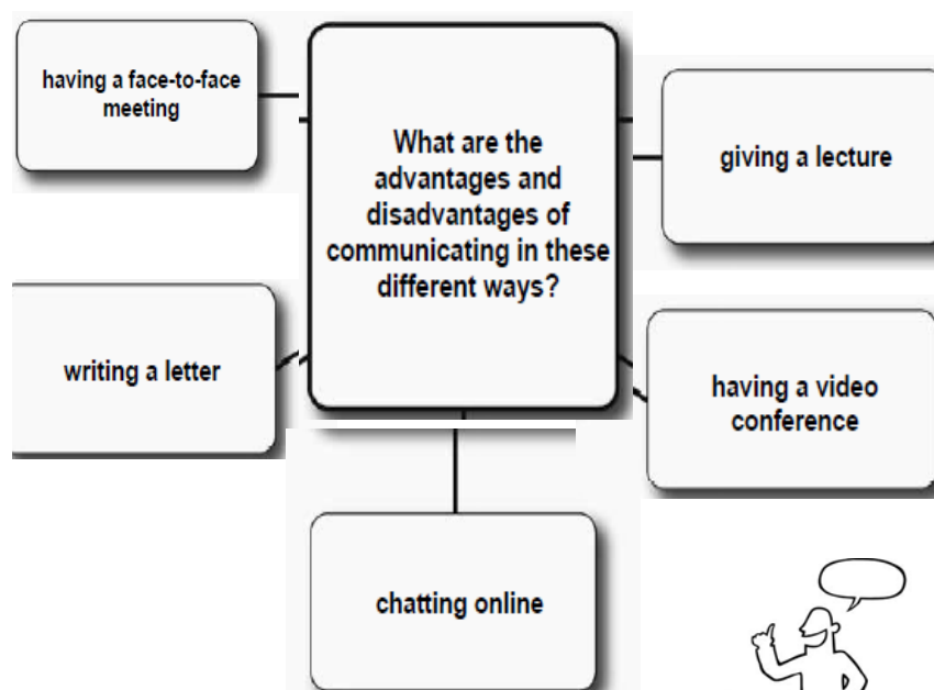
Fig. 1. New literacies and corresponding approaches to write coherently

A veritable Writing revolution: all purposeful text-types/ audiences/ contexts teens will engage with in real life.