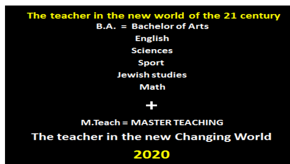
Fig. 2. A description of the training path for future teachers, towards 2020

Today Israeli teacher-training colleges have entered a new era necessitating an approach that will position the teaching discipline as a respected profession. The teacher of the future who wishes to train for work in 2020 will need to study for a Bachelor’s degree in a specific discipline (e.g. mathematics, biology, English, Jewish studies, sport etc.). Only after completing this first degree, if the candidate wishes to become a teacher and is found suitable to do so, then they will be required to study for an M.Teach.