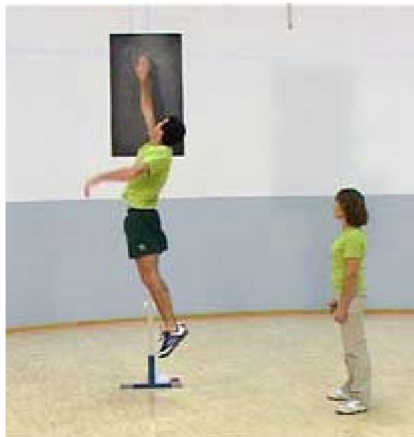
Fig. 1. Measurement by means of the Alpha Fit test