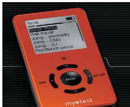
Fig. 2. The Myotest Pro Device

A second test was done by means of the MYOTEST PRO device (Fig. 2), which calculates the power, speed, and also the force under speed through a tridimensional accelerometer. The sensor can detect the acceleration during movement. The information obtained is transferred to a computer via a USB connection.