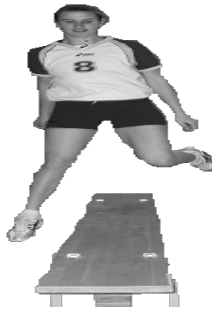
Fig. 1. Jumping over the gym bench