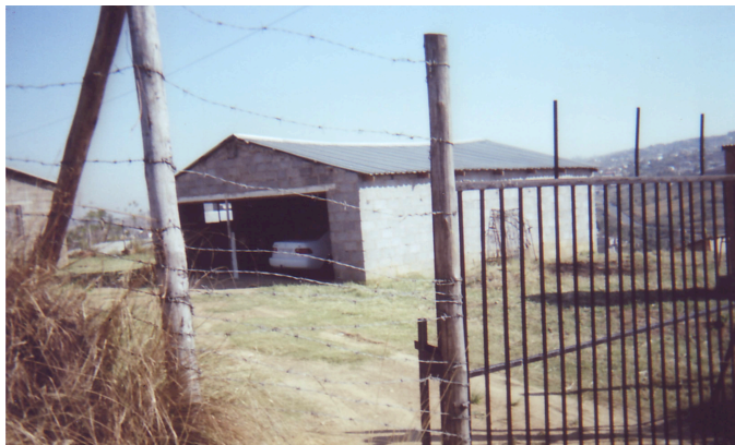
Figure 2: Outsider perspectives

Walls, gates, fences and barriers were recurrent in the photographic data and the biographical drawings, which prompted the idea of the 'walled solution'. The outsider perspective positioned the viewer outside contexts such as homes, the clinic and commodities. Photographs 'on the inside' prompted discussion from an interiorised perspective, facilitating reflections on life as a young man within a family, a school or peer group. 56 of the 80 photographs were of objects and environments rather than people, suggesting a sense of isolation and instrumentality which was also voiced in the interviews and depictions of losses and barriers in the biographical drawings. Displays of objects were frequent, often