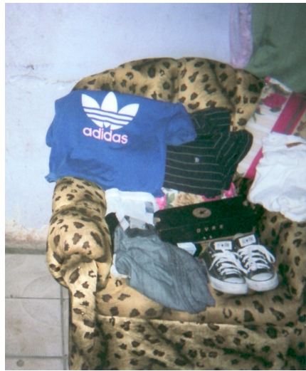
Figure 3: Displays of iconic items

relevant to social and interpersonal activities, such as football team posters, displays of personal clothing items, computers and mobile phones. There were no photographs of people playing sport or using computers or mobile phones which suggested instrumentality, isolation and a stark commodification of masculine identity. The photographs also revealed poverty and materially constrained living conditions, at odds with a commodity-based identity.