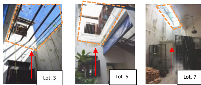
Figure 03. Air Well Centre Openings of Lot. 3, 5 and 7

we consider it the convenient space to pursuit.... As well as, we would have placed in the coolest area of our house near the courtyard.” the significance of such a space was by their being situated in sites destinations within the building or urban fabric. Therefore, this agrees with Meir (2000). The author stated that Traditional Courtyard surrounded by paved and landscaped with water bodies, numerous plants, light and shade, all played important roles in the social and working life. Therefore, with regard to Figure 3, the findings show that the courtyard was developed to be climate responsive. These architectural components express the Straits-Chinese identity in the courtyard because both the materials and the design speak volume of the rebuilding place.