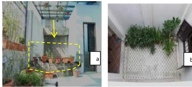
Figure 06. (a) The Water Fountain at roof garden of shop-houses No. 3 and 5 (b) Potted Plants at the Courtyard of Shop-house Lot.5

and 5 as presented in Figure 6a where the water fountain is one of the important elements related to place identity of Straits-Chinese which express their culture identity.