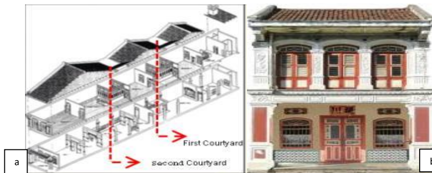
Figure 01. The Courtyard and Façade of “Late-Straits” Eclectic-style Traditional Shop-house

One of the important features of the formation identity shop-house is the courtyard or air-well as presented in Figure 1a. In this air-well, the spaces that have openings to the sky are opened. Bahauddin, Abdullah, and Ting (2011) argued that the typical feature is an Air_Well around situated inside the focal of shop-houses. The Air_Well works as an inside courtyard. The courtyard is the commonplace of the living planning anywhere of Chinese Mainland. It was transformed to air-well when space became more precious in this case. The “Late-Straits” This style is the most spectacular and vibrant of all shop-houses as presented at Figure 1b, it displays striking, varied and eclectic ornamentation, as well as the introduction of cultural influences such as decorative tiles ( Peranakan ) to the building eclectic-style shop-houses are thin in its width and higher in tallness. Shop-houses were assembled one next to the other with a typical party wall. As well as, they are long inward spaces without any openings along the traditional shop-houses side; they require the utilization of a few Courtyard (Air-Well). It improves shop-houses lights up and ventilation the back area to guarantee a decent wind current (Zwain & Bahauddin, 2015).