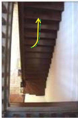
Figure 05. Staircase Taken from First Floor

Findings show that building Lot.7 staircase is located at the second hall, facing inward to the building. Hence, the three staircases are timber made winder staircases as shown at Figure 5 which is related to the Straits-Chinese identity style. Participant 24 says: “..... I consider the staircase an aesthetic element in interior design at my shop-house at the same time, the staircase show our wealth to guests because we are Straits-Chinese, with the beautifully carved with gold plated coin outline design like Ching Dynasty coin. We believe that every steps up of staircase, the money of the house will increase and again bringing the meaning of wealthiest to us. ” This indicates that the staircase as part of the courtyard and by extension, part of the architectural formation design components, expresses the place identity of the Straits-Chinese as well as their circulation system gradually shifts from public spaces to semi-private spaces and through the staircases to the first floor, which leads to private spaces. This agrees with Meir (2000). The author asserted that the winder is less common while the spiral staircase is the least. The three staircases buildings are timber made winder staircases.