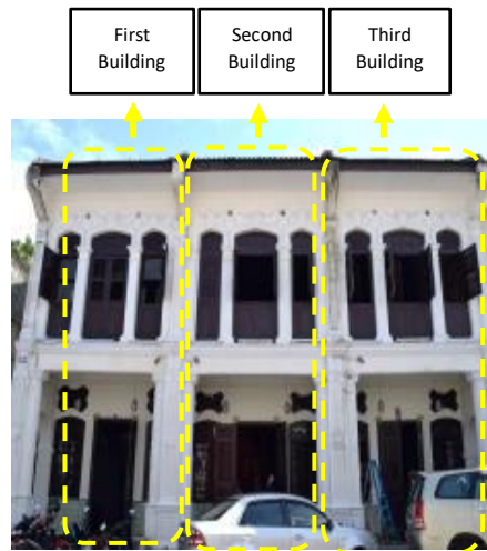
Figure 02. The Façade of the Traditional Courtyard Shop-houses No.3, 5, 7.

the surname Wong since 1926. Certainly, the cases studies of this research are a marvellous example of Straits Settlements.