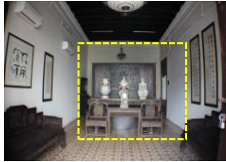
Figure 07. Vintage Straits-Chinese Screen at No.3 Shop-house