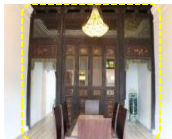
Figure 04. The Wooden Partition of (Lot. 3, 5, and 7) Shop-houses Buildings

From the observation, the wooden partitions are in Nos. 5 and 7 shop-houses as presented in Figure 4 with the exemption of building No. 3. Findings show that the wooden partitions are expression of the Straits-Chinese ( Peranakan ). This is one of the ways the Strait Chinese Participant 3 says “...wooden-screens are extremely wealthy in details and fine work surrounding the Courtyard space.... Moreover, as we are Straits-Chinese, we believe that sustaining the courtyard space feels the bliss when we are working around this building.” The resultant influence is rooted in the cultural identity of the Straits-Chinese playing out in the architectural formation design components.