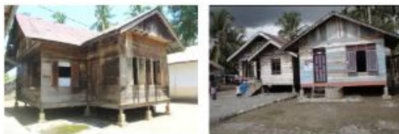
Figure 04. Display of stilted house in the West Coast of Aceh

Along with the development of building materials, the advancement of telecommunications, and ineffective reasons, combined with demanding needs and limited financial capabilities, people in the West coast built their homes with non-stage construction. Figure 03 shows a house on stilts with a pool of water below, a contradiction with the house next to it that was built and constructed on the ground. Changes in the shape of the building have an impact on the poor quality of buildings, building safety, and security. However, the stilt house as a vernacular house on the West Coast can reduce the impact of disasters on the safety of the population through the local wisdom of its architecture. The two types of house construction are shown in figures 4 and 5.