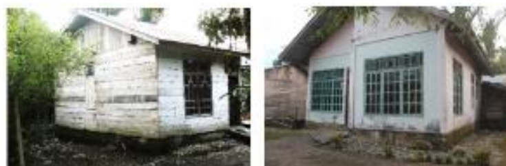
Figure 05. Display non-stage houses in the West Coast of Aceh