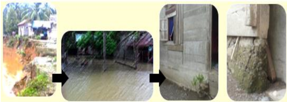
Figure 01. Floods eroded settlements and non-stage buildings in Tripa Makmur

Technology in architecture is always related to materials and construction that focuses on building sites and how to build. Learn and understand how the shape of the stage in the coastal region is born, and whatever in the community that has given birth to it, and in how the power or tradition is realized;