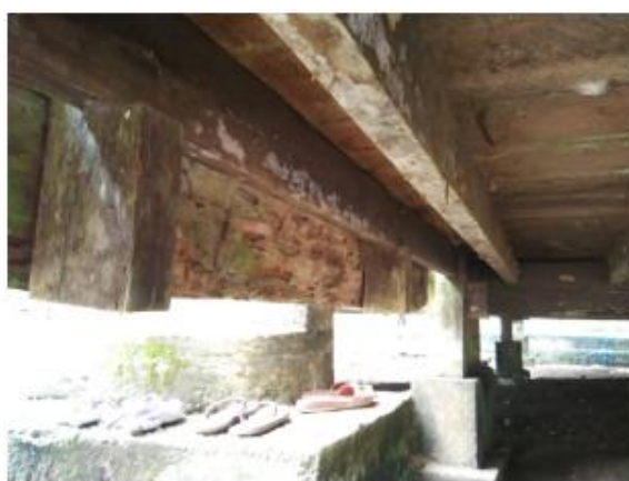
Figure 06. Traditional structural system on a stilt house on the west coast of Aceh

Sustainable architecture has a close relationship between architectural buildings and local characteristics and local climate. The geographical condition of the research location is peat soil, which is a soft soil type or low support capacity for buildings / houses and can be said to be the same as land in swamps. Figure 6 shows the height under the houses on stilts is relatively low in Kuala Tripa (50 cm to 80 cm) so that the burden of the building is not too large, because it is on unstable land. The traditional method of laying on a stage house pole is not on hard ground, but on soft ground with swear foundation. With the merging of the construction of the pole above the umpak , the shaking of the building will follow Earth's gravity if there is an earthquake vibration so that the construction remains stable. Unlike the rigid concrete foundation and less flexible to vibration. Furthermore, floods in swamp areas can damage wooden poles placed on stone pillars.