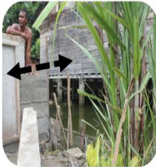
Figure 03. Two types of house construction, non-stage and stage. Ideally, home land will become an area of water infiltration in this wetland environment