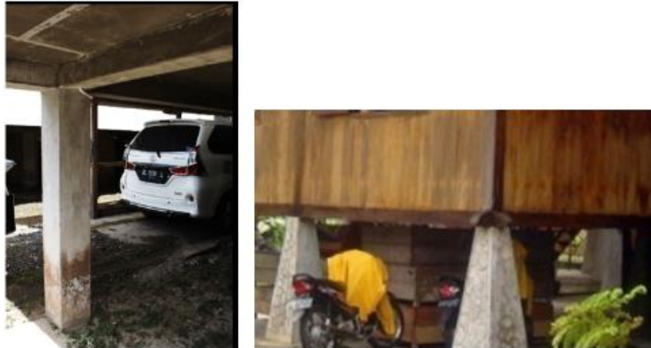
Figure 07. Reinforced concrete pillars of the conventional method are appropriately applied to stilt houses on the west coast of Aceh today

The coastal area has high rainfall accompanied by strong winds which cause sea level rise. Based on these conditions, the stilt house at the research location already has a slope of the roof that can drain rain water without seeping into the building and can anticipate strong winds that can destroy roofs, walls, and building structures.