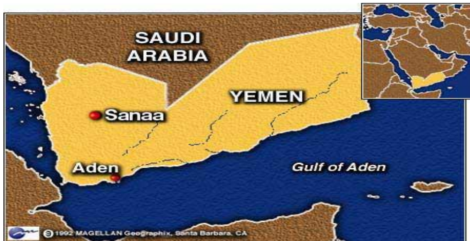
Figure 01. Location of city Aden

In the 14th century, Yemen was acknowledged for a new crop, coffee and the coffee was exported throughout Mediterranean countries. The Ottoman Turks dominated and ruled Yemen in the period of 1538 through 1635 and later retreated to the North Yemen between 1872 and 1918, while, Britain dominated and ruled South Yemen from 1832 onward as protectorate. The location of the city is shown in Figure 1.