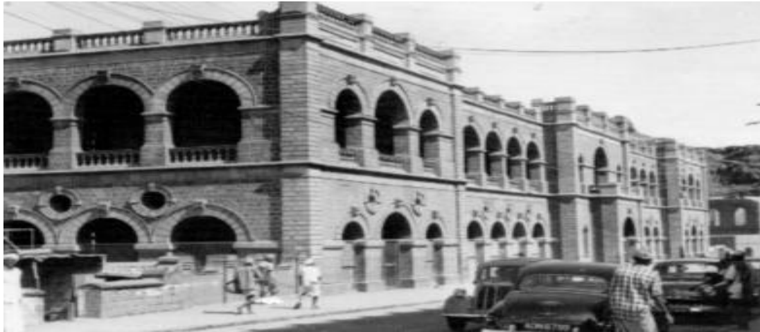
Figure 02. The Museum military building in colonial era – in Aden, Yemen

A typical colonial military museum was used to do the general review of this study with the engagement of descriptive analysis. Figure 2.