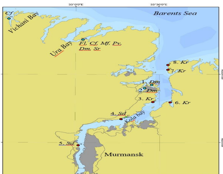
Figure 3. Map of the rare (blue circles) and preserved (red circles) algal species of the Kola, Ura and Vichani Bays (Barents Sea). Numbers indicate the areas of algae collection: 1. Oleniya Bay, 2. Pala Bay, Korabel'naya bay, 3. Tonya village, 4. Belokamenka village, 5. Min'kino village, 6. Srednyaya bay, 7. Cape Baklaniy, 8. Cape Letinskiy. Abbreviated taxon name of algae see figure 1 captions