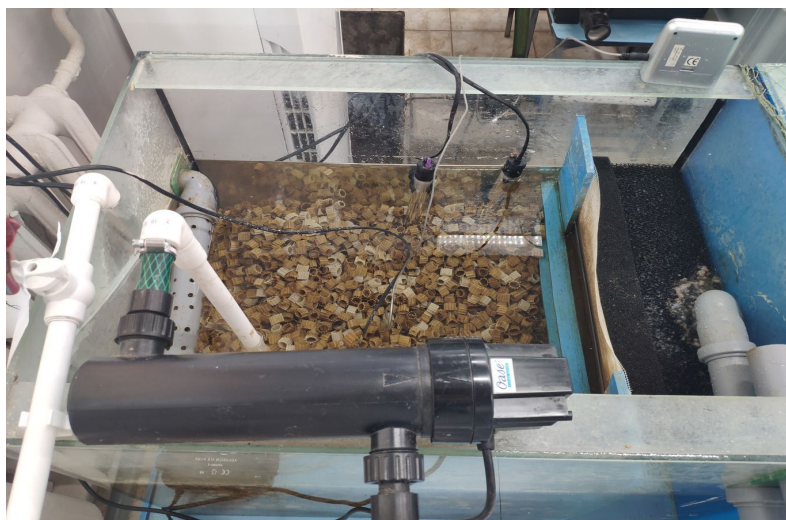
Figure 3. General view of the biofilter

For the experiment, an experimental setup was created, consisting of three aquariums of 200 liters each and a biofilter. The biofilter with a volume of 100 liters consists of: a mechanical coarse filter, a mechanical soft filter, a mesh separator and a sinking bio-load MbbR K1 kaldnes. The pump pumps water from the biological compartment of the filter and passes it through the UV filter Vitronic 11 W OASE, delivers it to each aquarium through a 20mm pipe. The type of biofilter is shown in Figure 3.