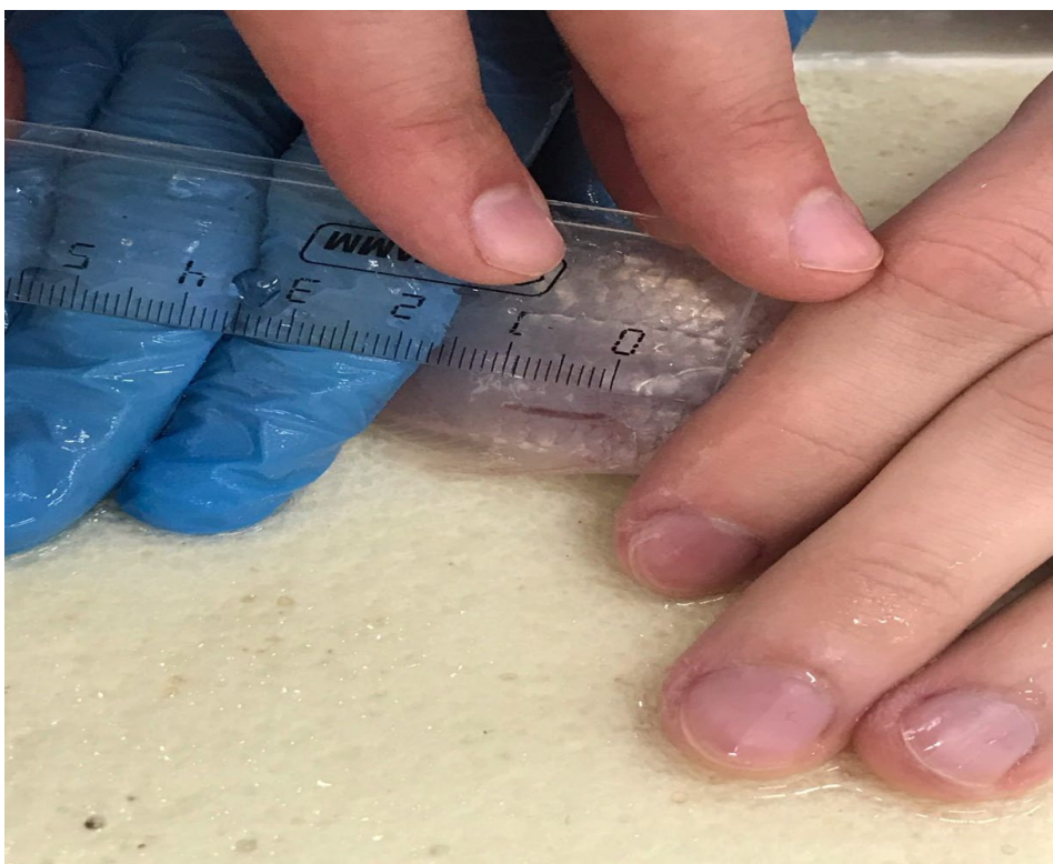
Figure 4. The process of creating a section

The essence of the experiment is to determine the effect of sodium alginate biocapsules on the effect of Bacillus subtilis in the rate of regeneration of superficial wounds. For this, a 10x1 mm incision was made on each fish at the base of the dorsal fin on the left side. The fish were weighed before the incision. The fish weighed 92 ± 7 grams. After 30 minutes after the incision, the fish were fed and the response to the food was assessed. All groups tolerated the incision well and actively consumed food. The section creation process is shown in Figure 4.