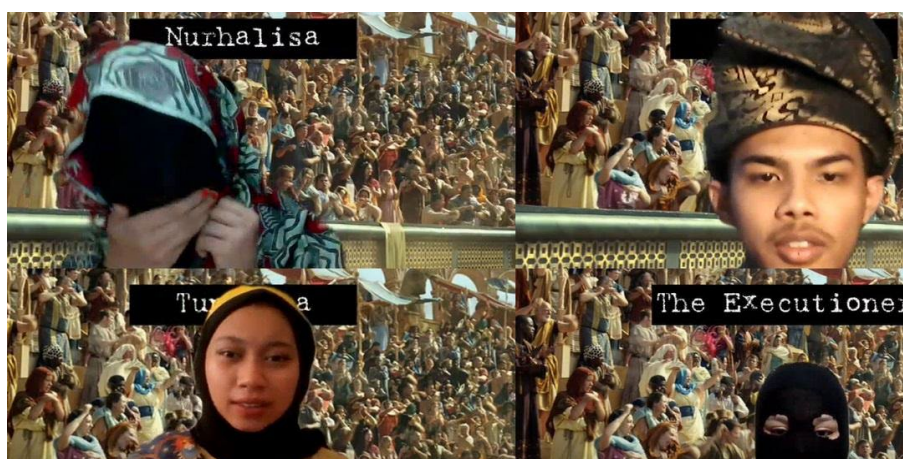
Figure 3. ORT of ‘Swordfish and Concubine’ using green screen

Being digital natives, the students were naturally apt at searching for the right technological tools to complete their assessment task. Their positive experience while preparing for the task indicated that even in crises, the learning experience was undisrupted, and students were fast at adapting themselves to the limitations caused by the pandemic.