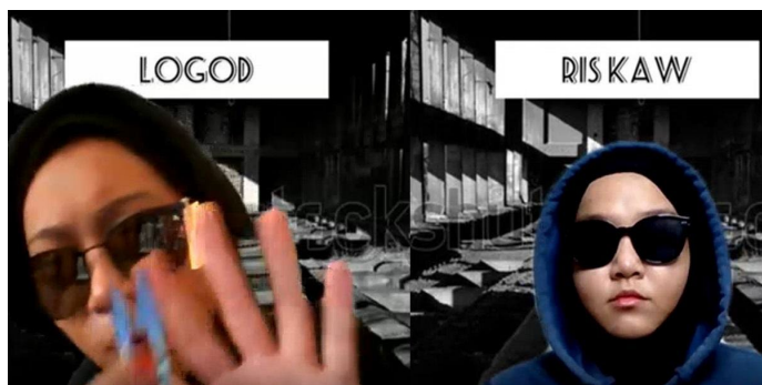
Figure 4. ORT of ‘Swordfish and Concubine’ using video split screen