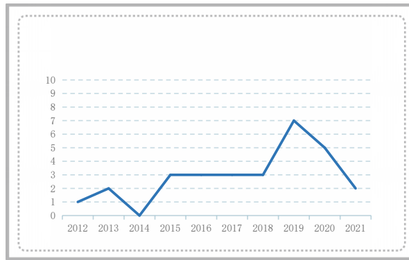
Figure 1. Frequency of studies by year published (N=29)

Research question 1: What are the general trends in the number of relevant publications?