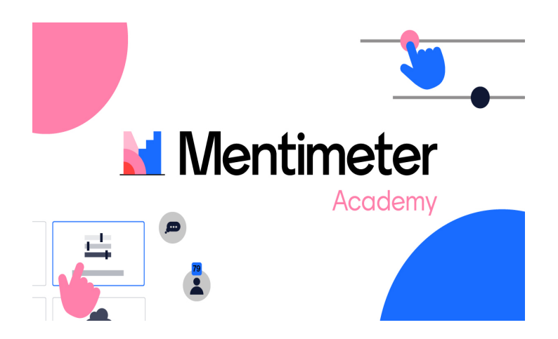
Figure 4. Interactive presentation software

As adult learners increasingly use their mobile devices, it can only boost the phenomenon of elearning, facilitating the expansion of online courses on tablets and smartphones and beyond. Romania, in turn, announces a market for online courses in a vigorous growth, encouraged by companies concerned with the development of Romanian education.