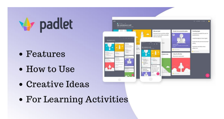
Figure 1. Padlet

2. ADDIE (Figure 2) enables the teacher of Romanian as a L2 defines the aims and goals of the elearning course. It is an acronym stands for Analyze, Design, Develop, Implement, and Evaluate. Its main role is knowledge assessment. The teacher/trainer must introduce the exact materials with a focus on levels of Romanian, vocabulary or grammar improvement. In the design phase, the focus is on learning objectives, content, exercise, lesson planning, assessment instruments for the adult learners. The teachers/trainers of Romanian as a foreign language focus on the following: